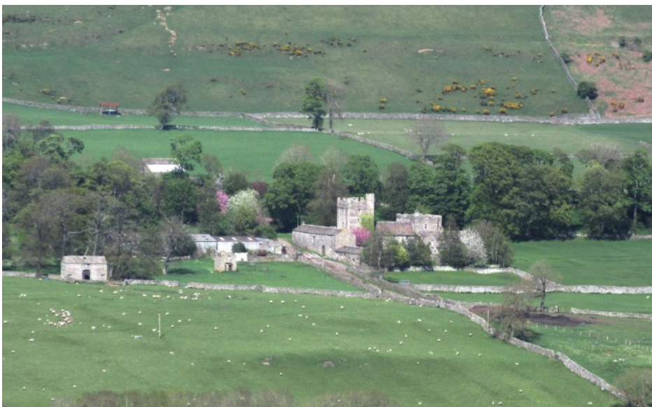
View of Nappa Hall, Wharfedale